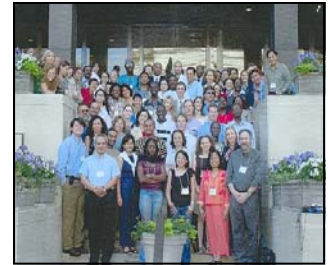
Health & Human Rights Class of 2004

GLP and the Boston Center for Refugee Health and Human Rights organized several trainings for physicians, psychologists and social workers on health and human rights for survivors of torture and refugee trauma.