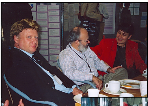
Participants in GLP Sponsored Roundtable on Strategies to Unite Bioethics & Human Rights - 7th World Congress in Sydney, Australia